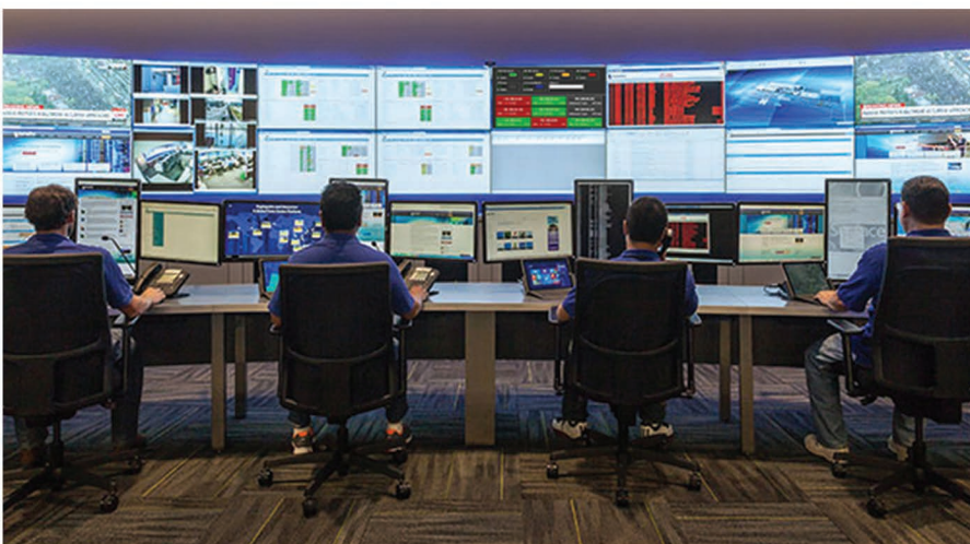
The StreamScope EM-50 is a cost-effective way to monitor and manage video quality and regulatory compliance across your DTV network.